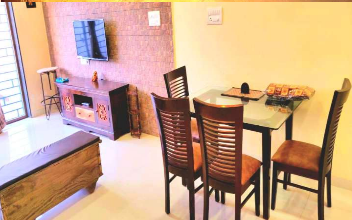
▪ Dining Area (AC).