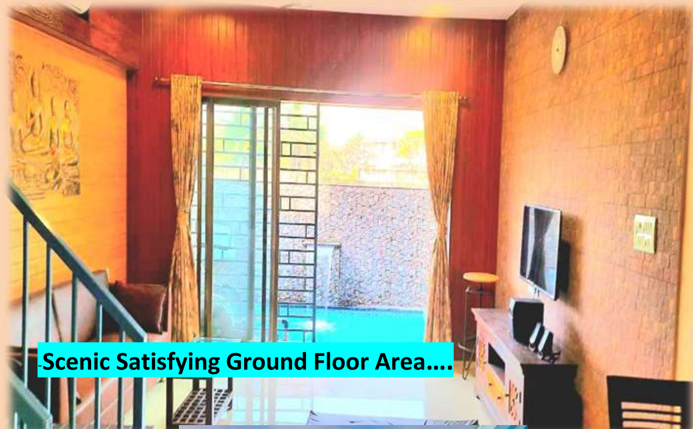
Scenic Satisfying Ground Floor Area....