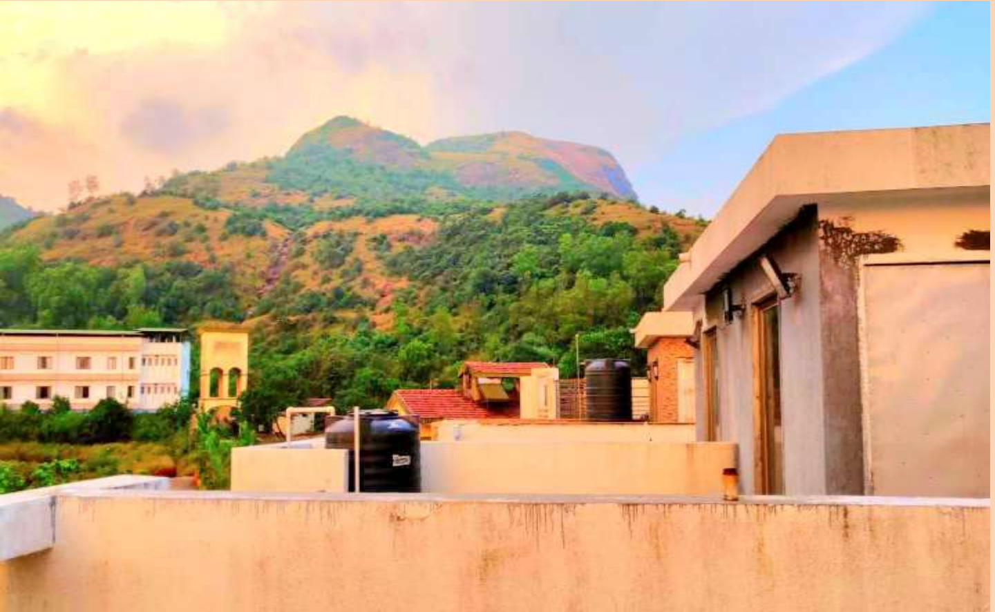
▪ Terrace with Stunning Mountain views Near to Walvan Dam.