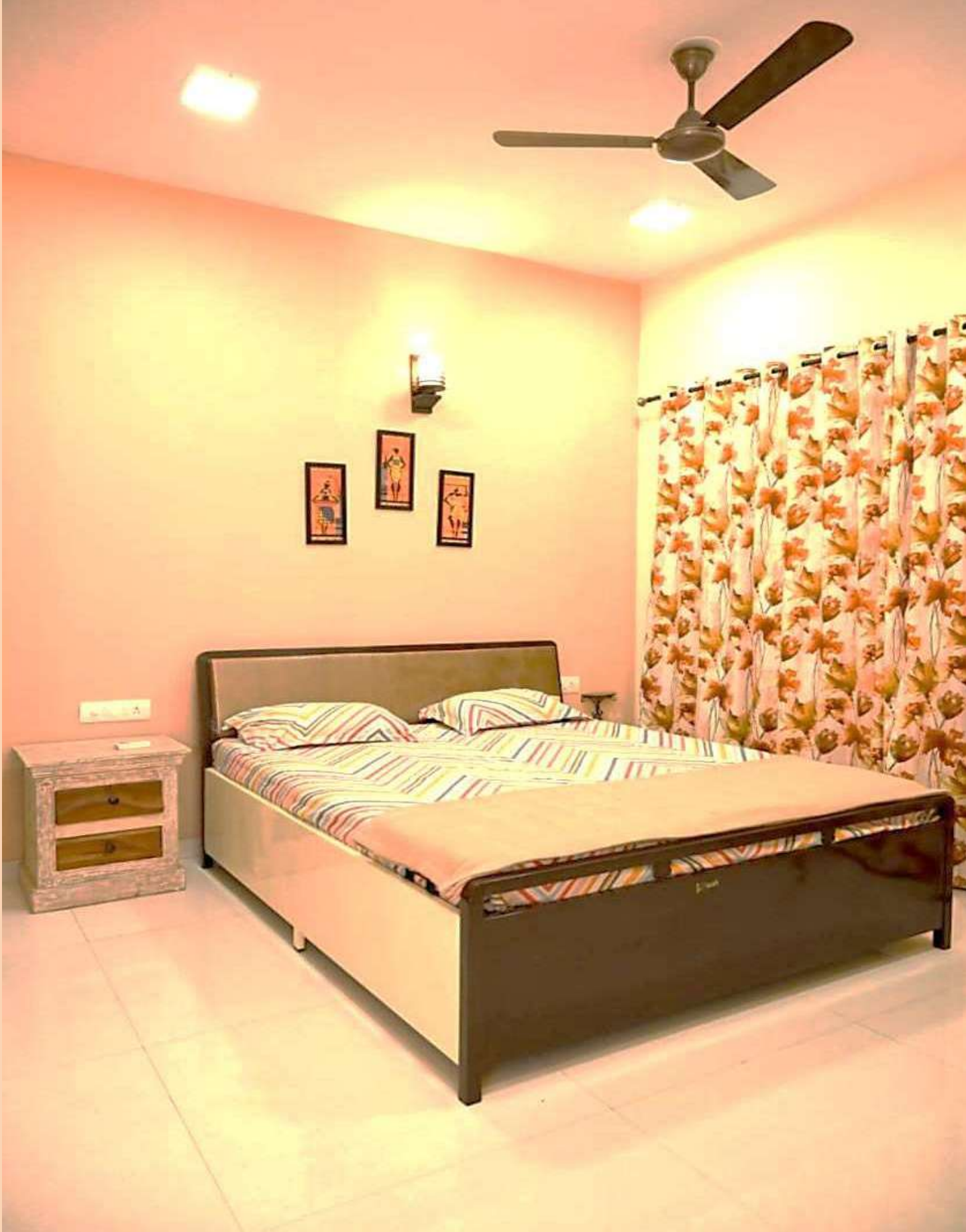
Bedroom No 2 (Ac) Attached Bathroom