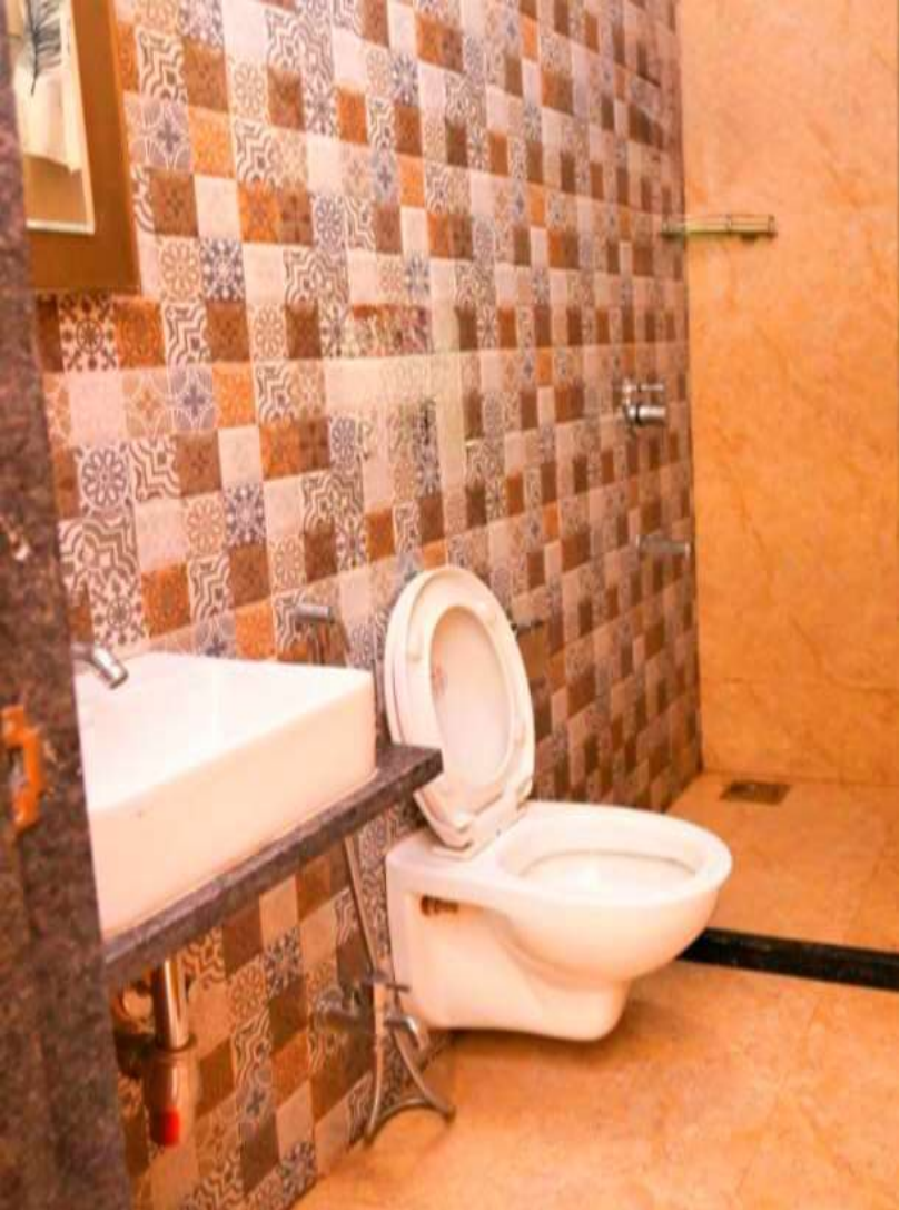
Bedroom No 1 ( AC ) Attached bathroom