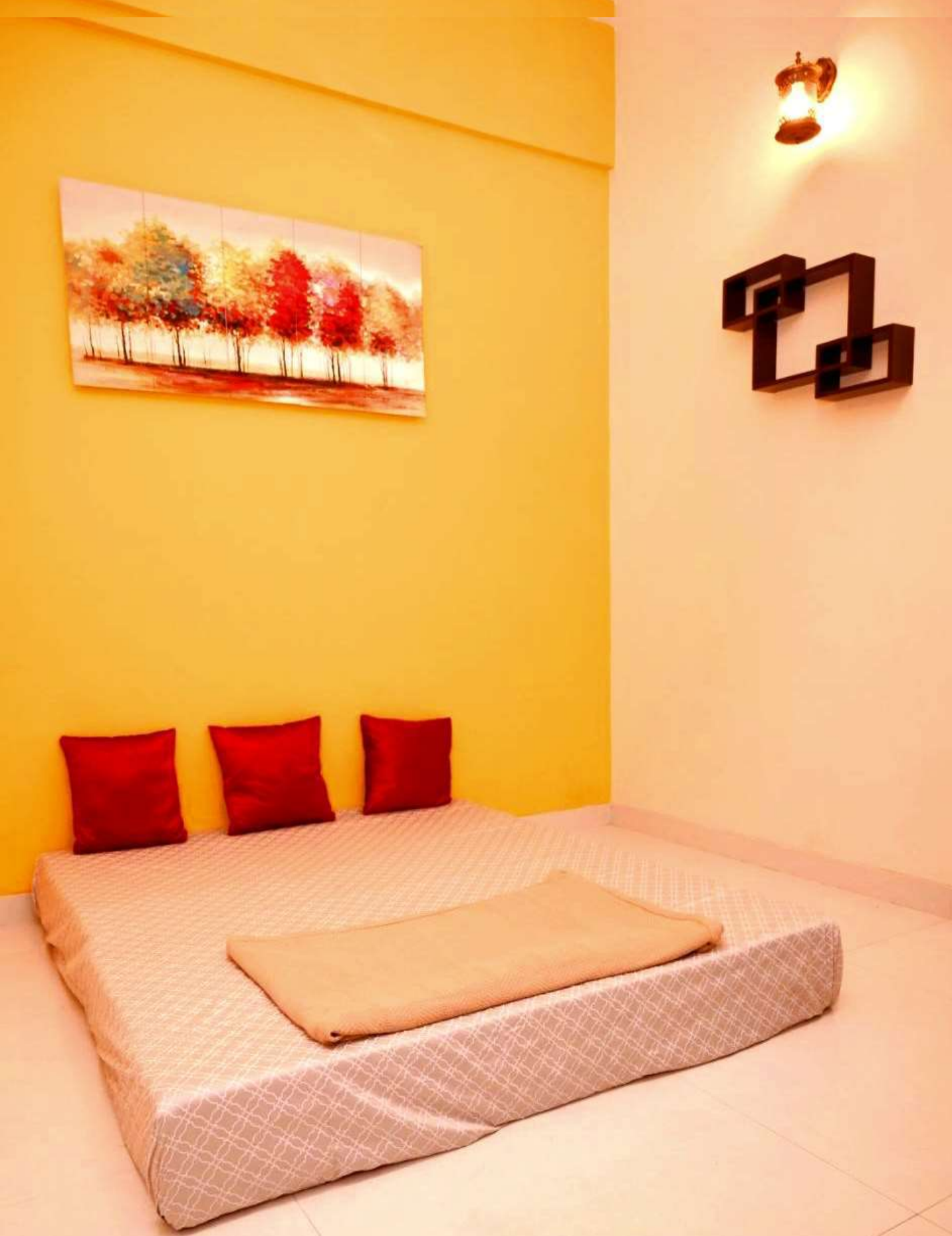
Extra Mattresses For Extra Person In Separate Space (4+6 =10) Guests