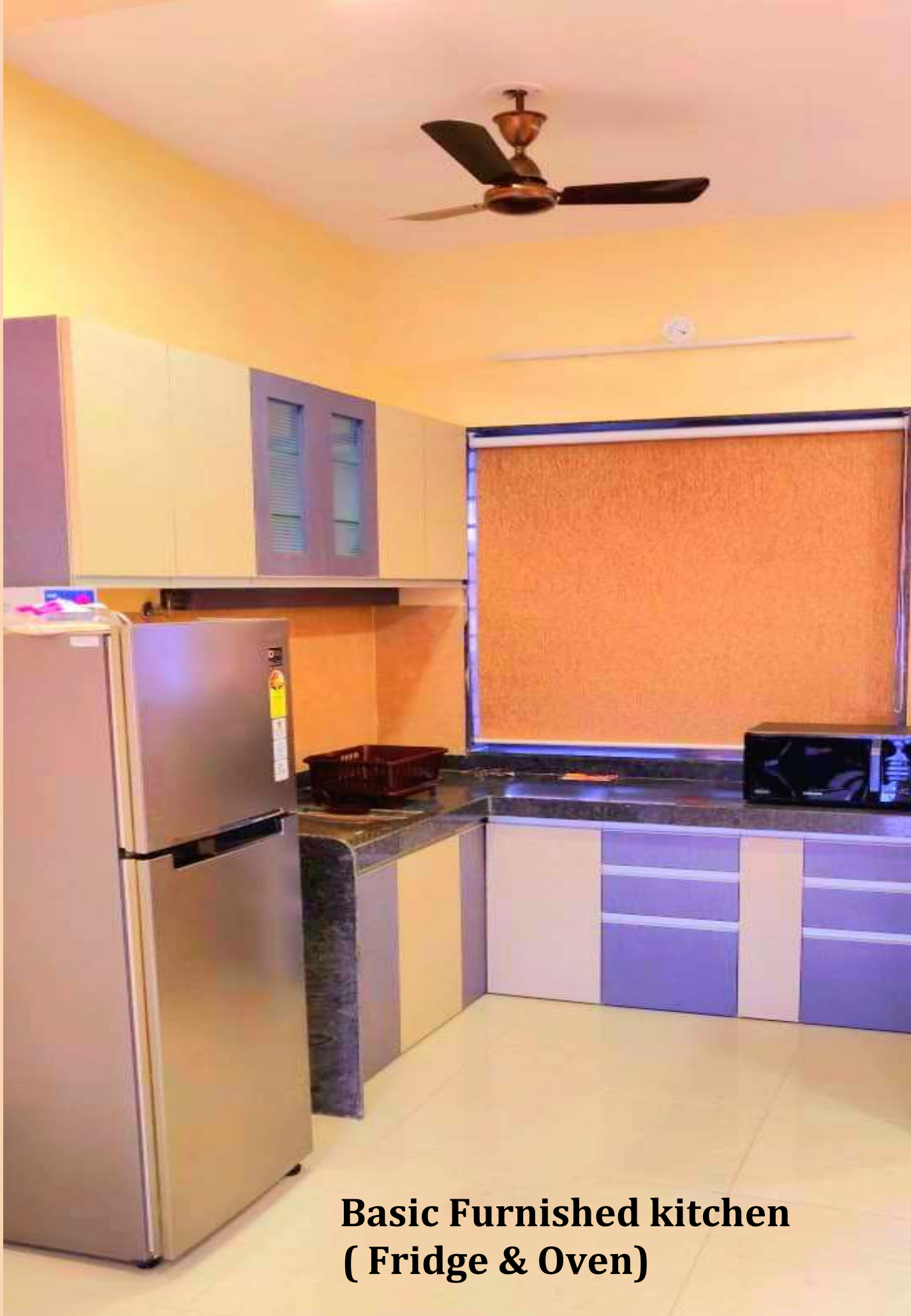
Basic Furnished kitchen ( Fridge & Oven)